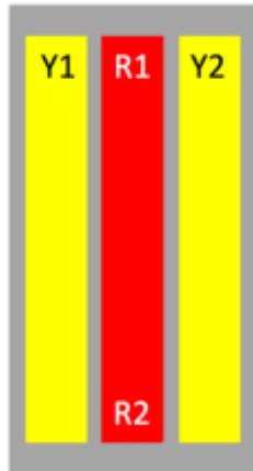
RF Connector Port Configuration

The 8-Port array topology consists of 3 radiating arrays: R1 – 698-728MHz R2 – 758-894MHz Y1 – 1695-2400MHz Y2 – 1695-2400MHz